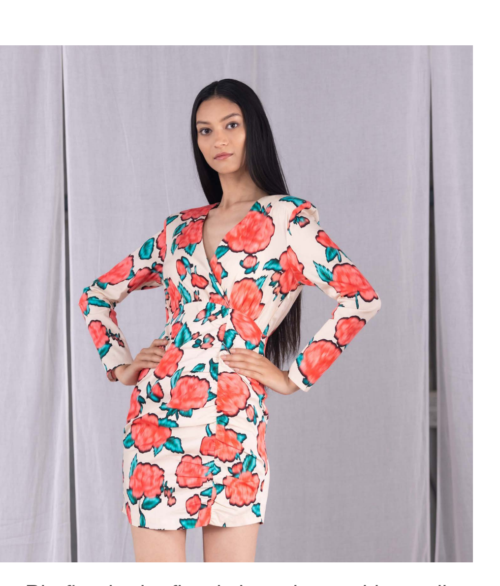
Big floral print fitted short dress with surplice neckline Composition - 95% cotton 5% spandex Original print design concept