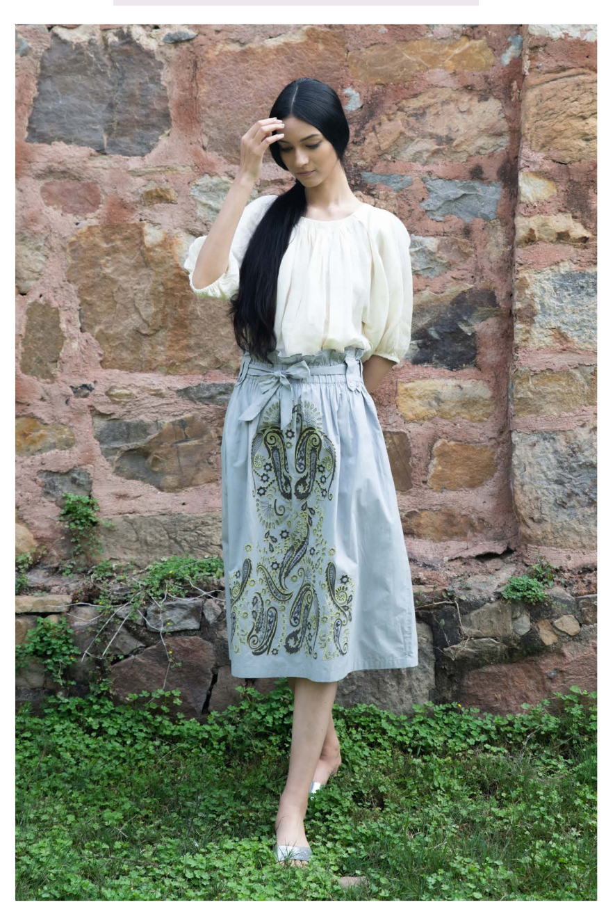
Embroidered paper bag skirt with belt Composition - 100% organic cotton In house embroidery concept