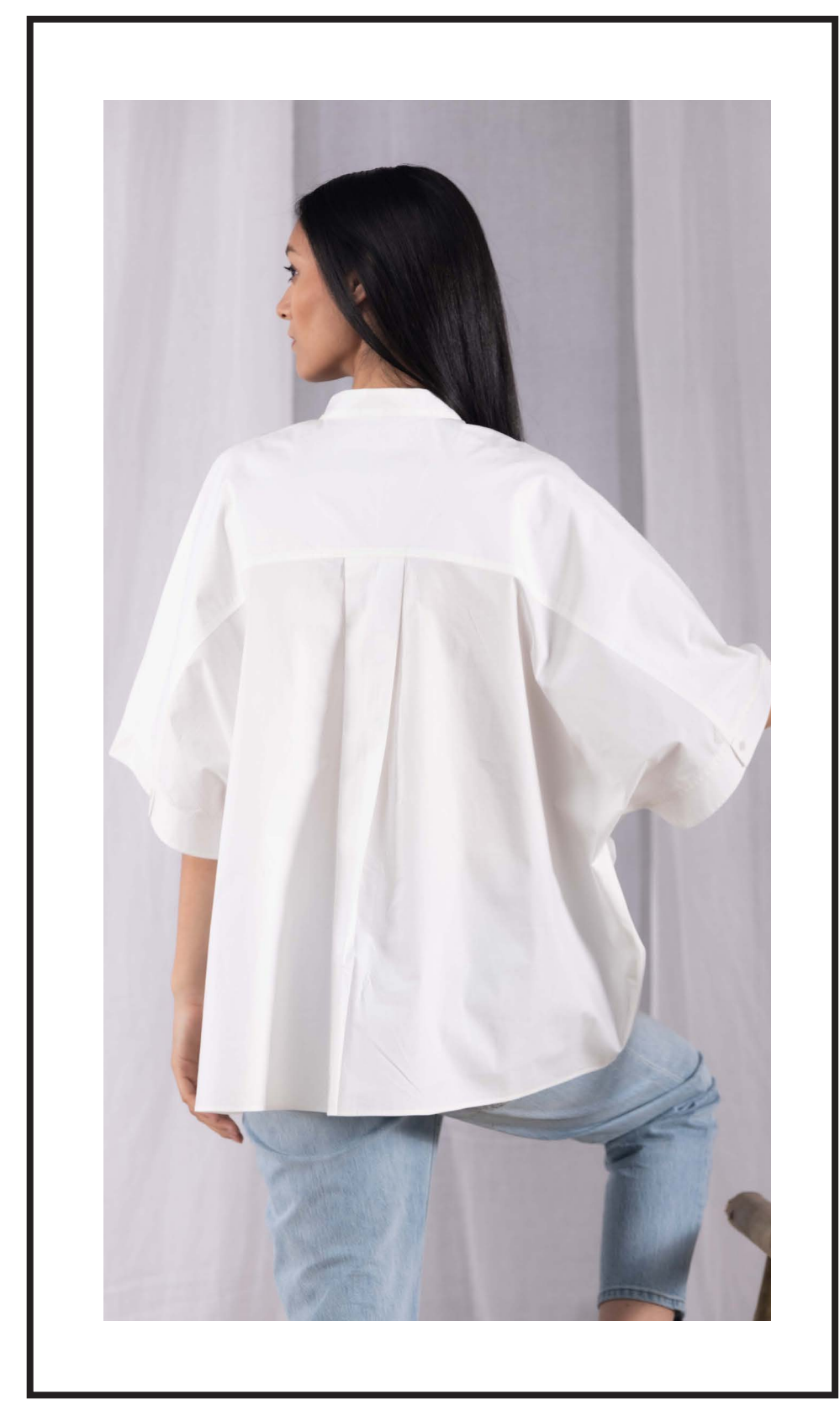
Loose fit printed shirt with graphic print Composition - 100% organic cotton Original print design concept