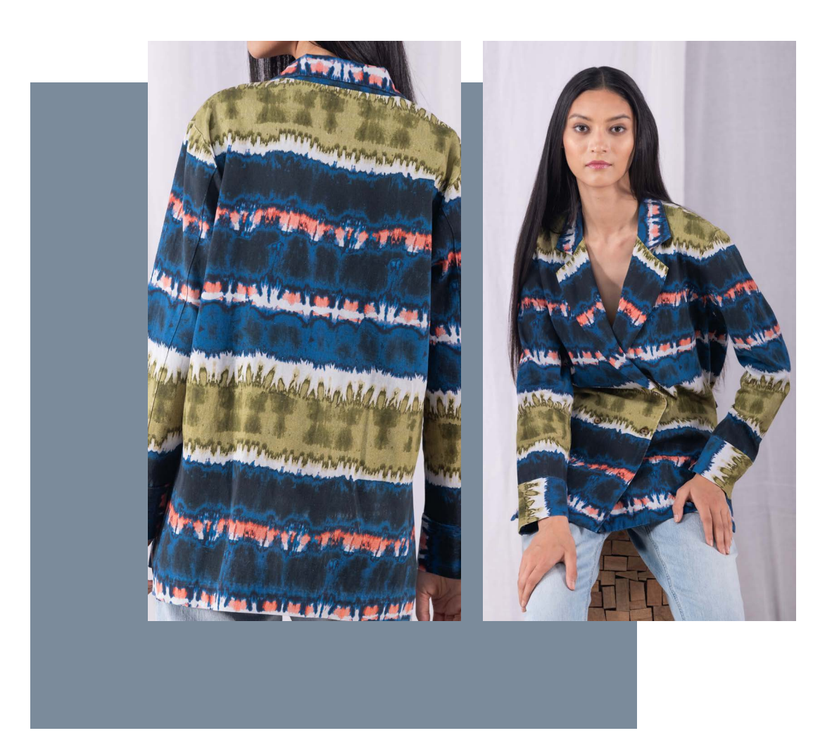
Tie-dye printed jacket Composition - 100% cotton twill Original print design concept